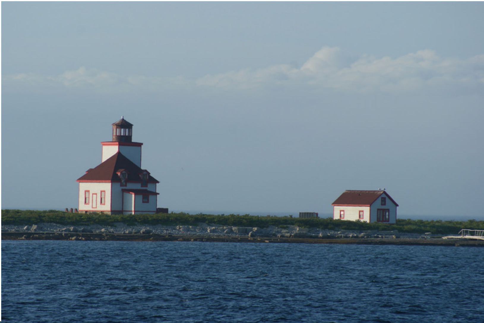
Can-NF-Flowers Cove Island