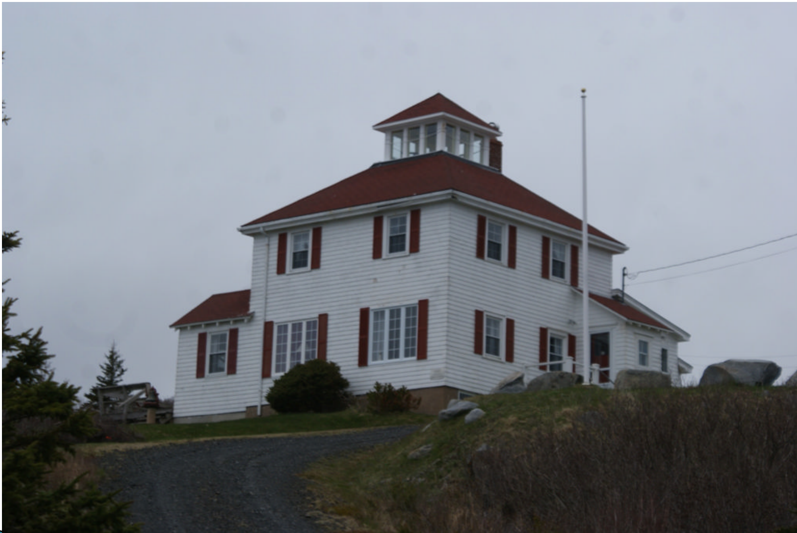
Can-NS-Medway Head Old