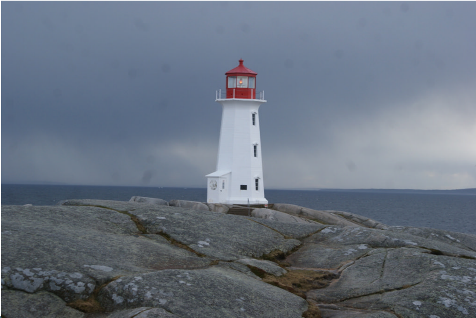
Can-NS-Peggy's Cove Light