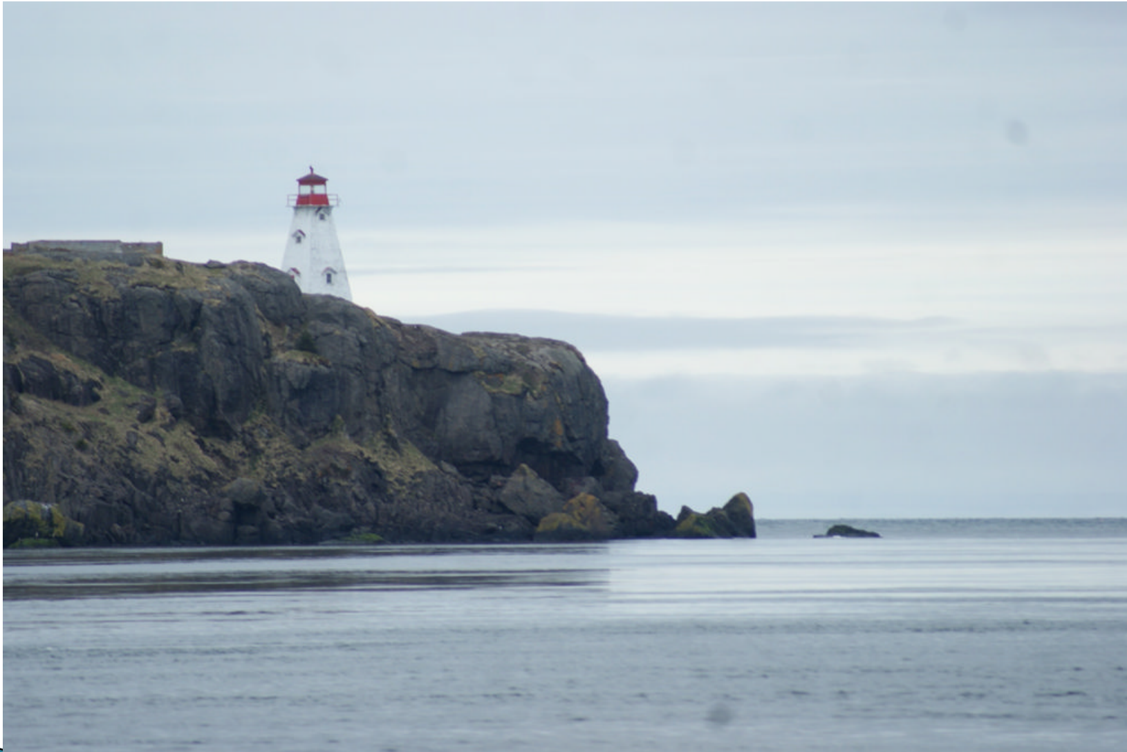
Can-NS-Boar's Head (Tiverton)