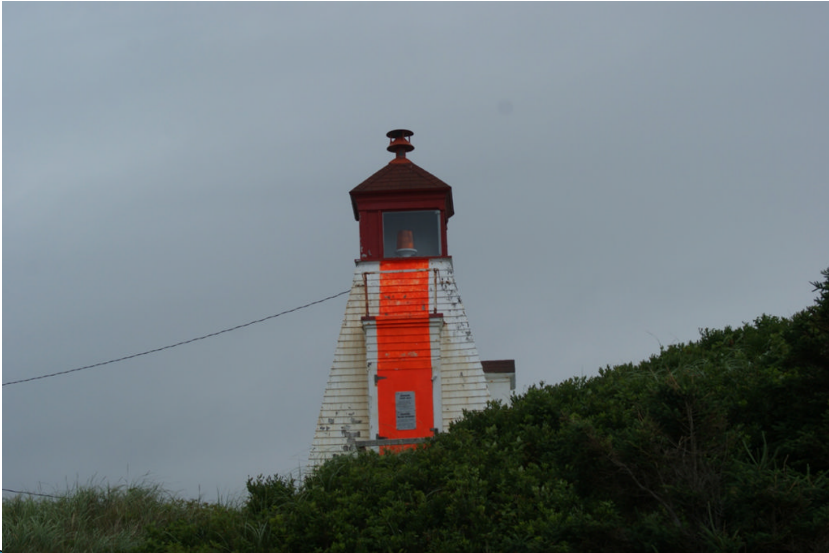
Can-NS-Margaree Harbour Range Front