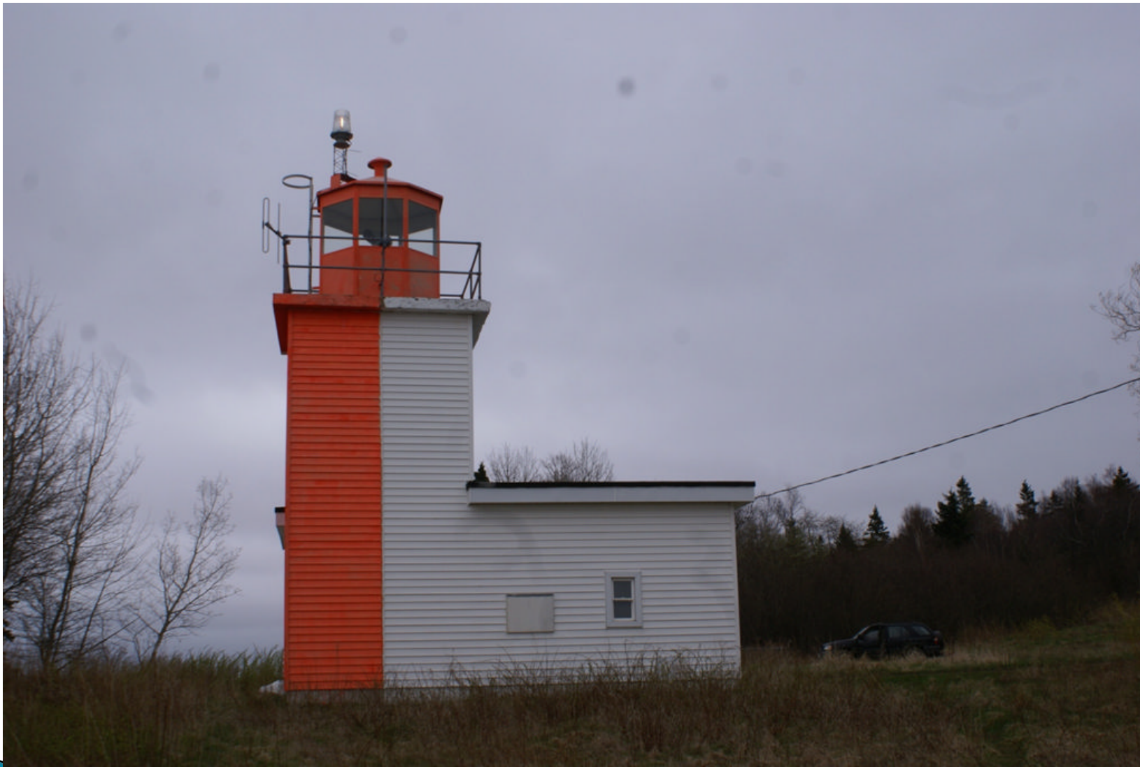
Can-NS-Horton Bluff Range Front