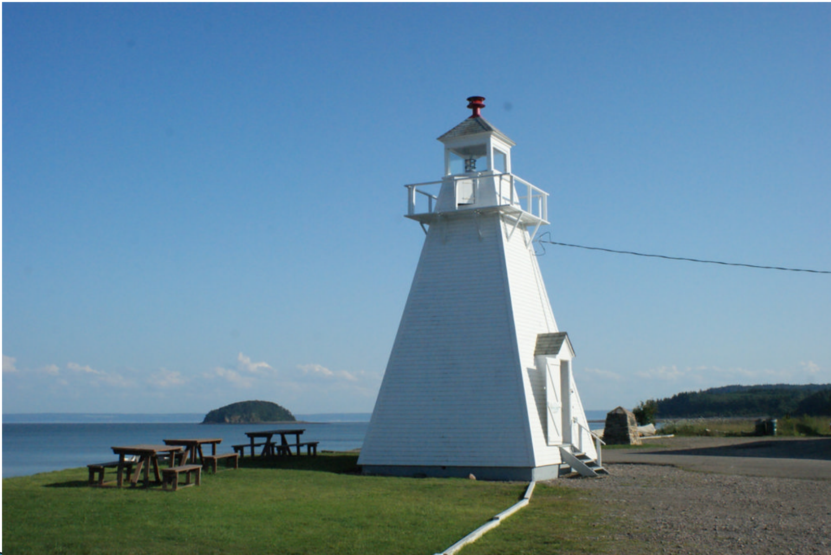
Can-NS-Spencer's Island Lighthouse