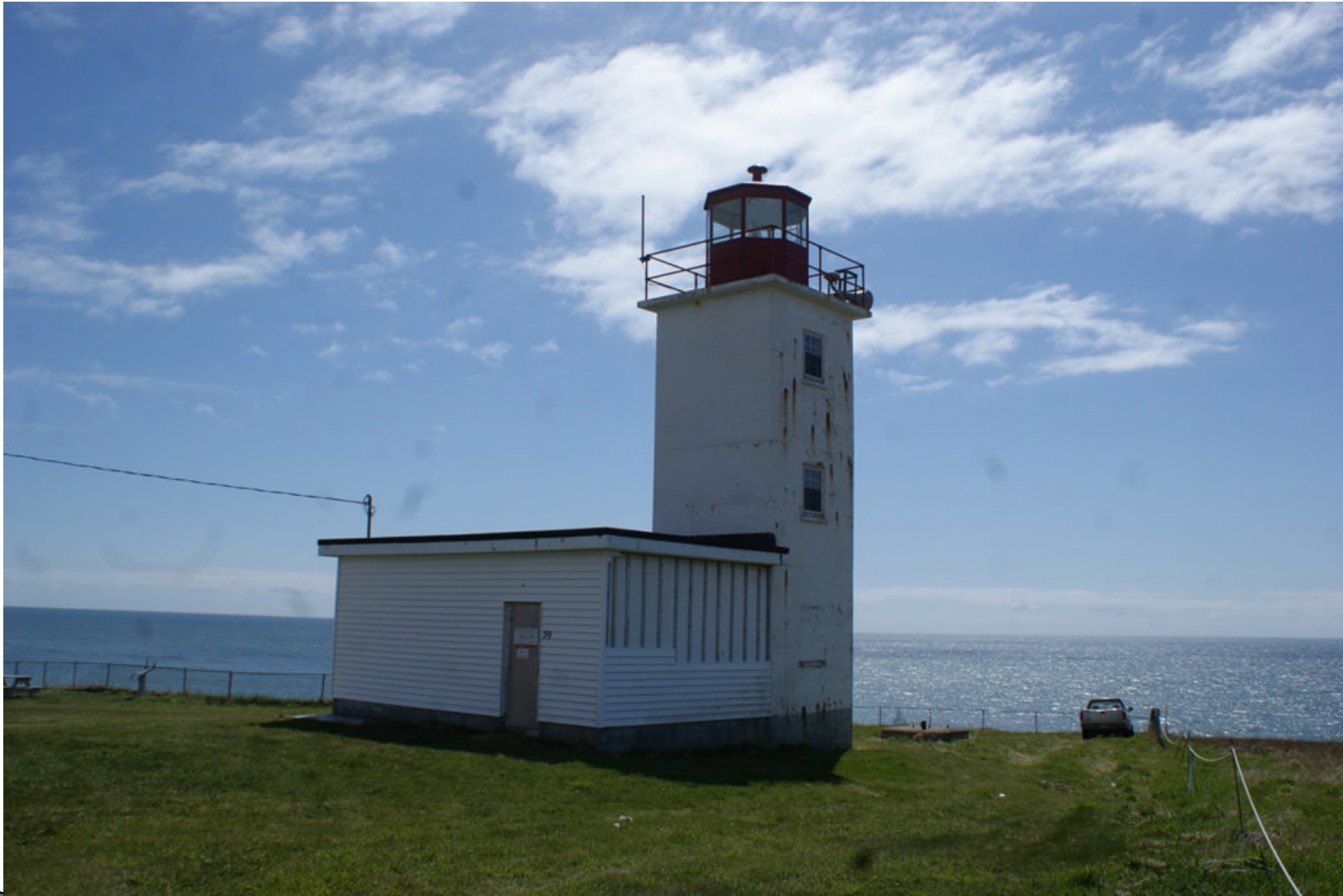
Can-NS-Cape St. Mary Lightstation