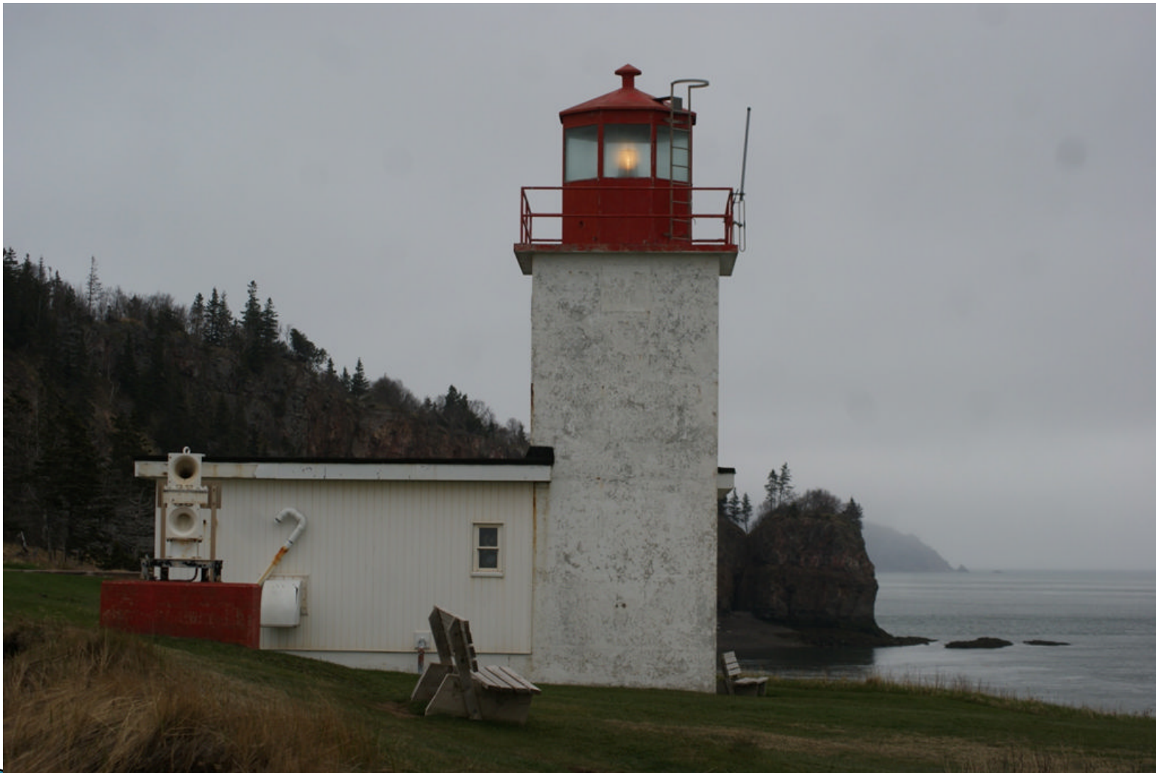
Can-NS-Cape D'Or Light